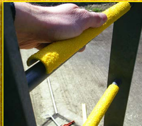
Hi-Traction® Ladder Rung Covers offer Anti-Slip protection for additional safety in the most dangerous work areas

Safeguard® Hi-Traction® Covers are an excellent long-term safety investment compared to anti-slip tapes or paints that cost more money and time in the long run. Safeguard also backs its Hi-Traction® Covers with a 5 year warranty.