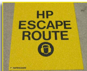
Hi-Traction® Safety Yellow Walkway Covers are available in custom sizes, colors and configurations

Hi-Traction® Ladder Rung Covers are prefabricated for fast and easy on-site installation over stairs, walkways, decks, and ladder rungs. The Covers can be installed using screws, bolts and nuts or liquid adhesive, depending on the application.