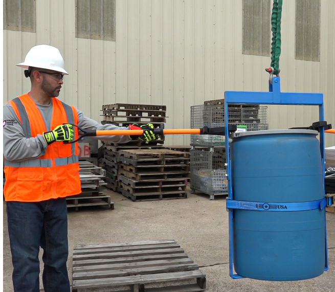
Effectively work within a safe distance of objects that may cause hand, arm, foot and even full body injuries.

The Shovelt® helps workers avoid costly hand injuries while working with suspended loads or maneuvering objects, maintaining proper body positioning for safe handling out of the line of fire. It enables users to guide loads, move and position pipes and tubulars, as well as grab slings and tag lines without physically placing hands on the item.