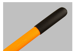
Rubber End Grip