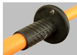
Hand Guard With Tethering Point