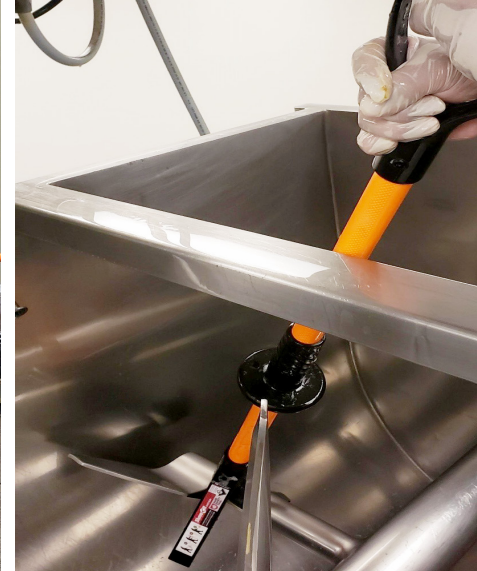
Use the Shovelt® to push objects where potential hazards exist such as rotary equipment and auger fins.