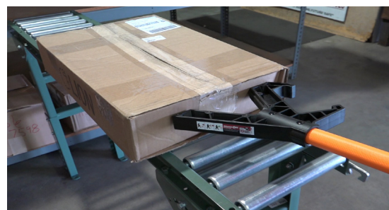
Use for a variety of tasks where “no touch” is required.