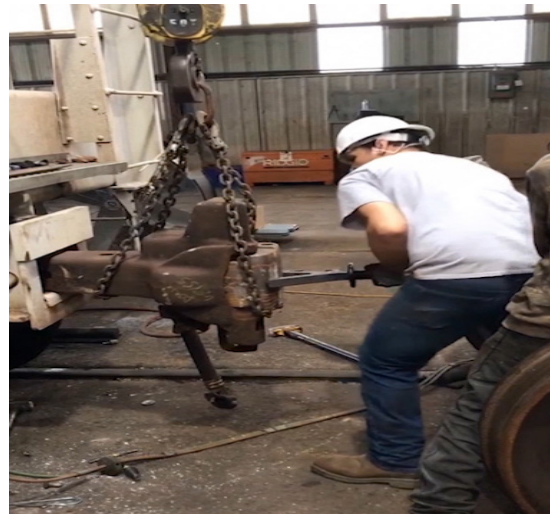
The Shovel® provides a balanced center of gravity and enables workers to remain a safe distance from dangerous crush and pinch points.