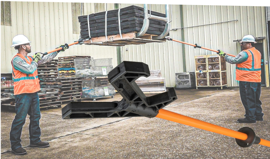
The versatile V-shaped head allows workers to safely push and pull against flat surfaces, corners and tubulars.